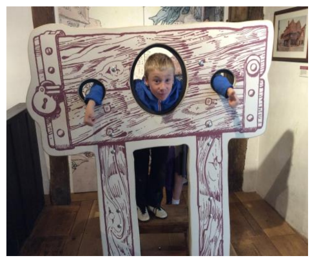
Year 4 visited Tudor House in Southampton and had fun experiencing life in Tudor times