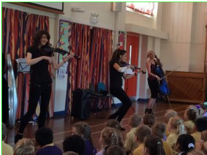
Cord Elektra entertain KS2

Nursery enjoy an end of term sing-a-long!